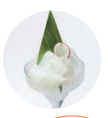
イカ SQUID 7.5