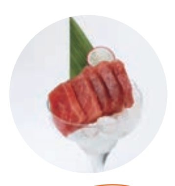
マグロ RED TUNA 7.5