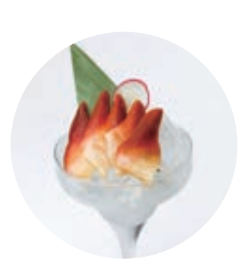
ホッキ貝 SURF CLAM 7.5