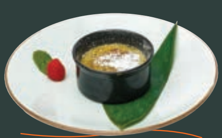
抹茶クリームブリュレ Matcha Crème Brûlée 6.9

Please let a member of staff know if you have any allergies or dietary requirements and they will be happy to assist you.