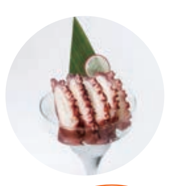
タコ OCTOPUS 7.5