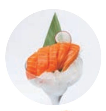
サーモン SALMON 7.5

3 Slices of Red Tuna Sashimi 3 Slices of Salmon Sashimi 3 Slices of Sea Bream Sashimi 14.5