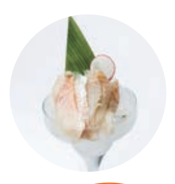
タイ SEA BREAM 7.5