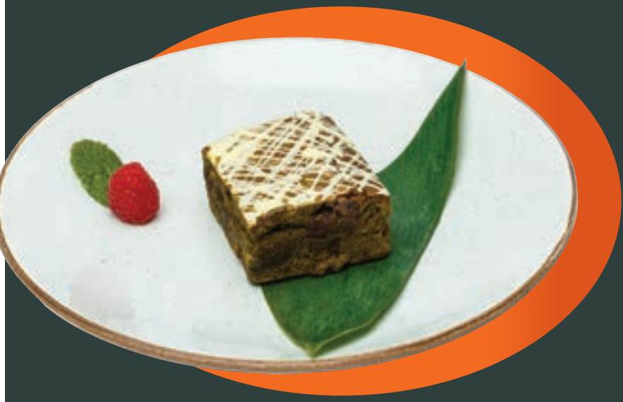
チョコレート抹茶ブラウニー バニラアイス添え Chocolate Matcha Brownie with Vanilla Ice Cream 6.9