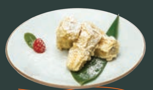
バナナフリッターバニラアイス添え Banana Fritter with Vanilla Ice Cream 6.9