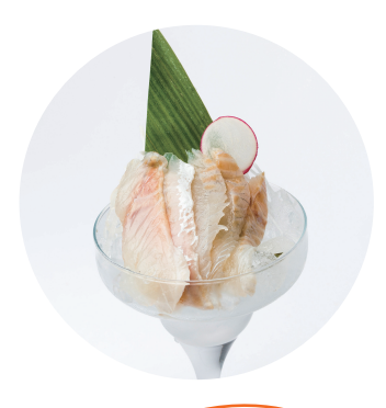
タイ SEA BREAM 7.5