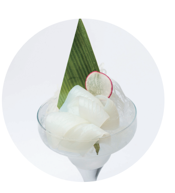
イカ SQUID 7.5