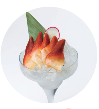
ホッキ貝 SURF CLAM 7.5