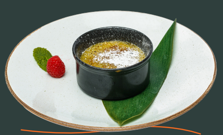
抹茶クリームブリュレ Matcha Crème Brûlée 6.9

Please let a member of staff know if you have any allergies or dietary requirements and they will be happy to assist you.