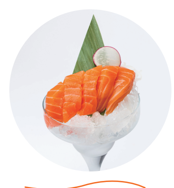
サーモン SALMON 7.5

3 Slices of Red Tuna Sashimi 3 Slices of Salmon Sashimi 3 Slices of Sea Bream Sashimi 14.5