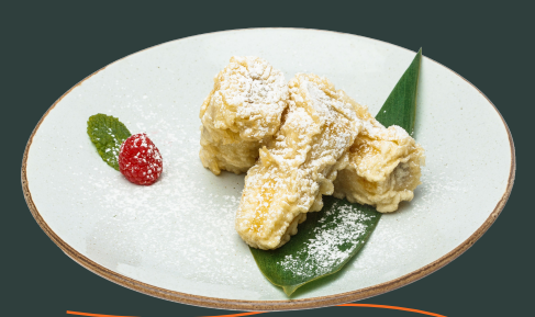
バナナフリッターバニラアイス添え Banana Fritter with Vanilla Ice Cream