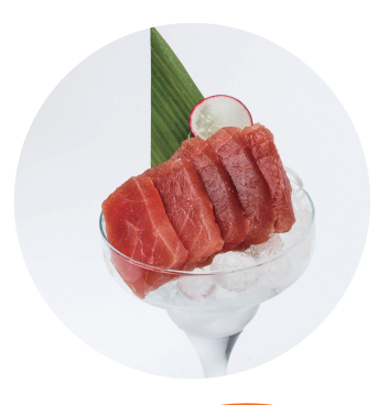
マグロ RED TUNA 7.5