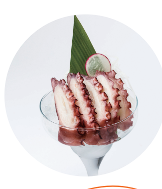
タコ OCTOPUS 7.5